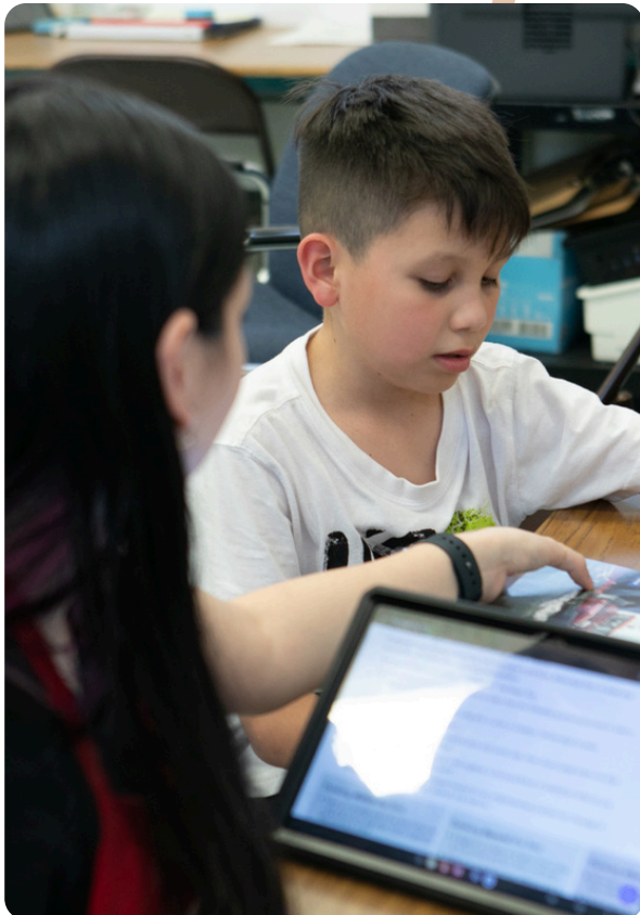
READ USA tutor and student

READ USA's proven, multi-faceted approach to workforce development and improving childhood reading proficiency has attracted investment from all sectors. Public, private, and nonprofit funders have witnessed the momentum and accelerated growth that READ USA has facilitated within the students and teens we serve alongside our partners.